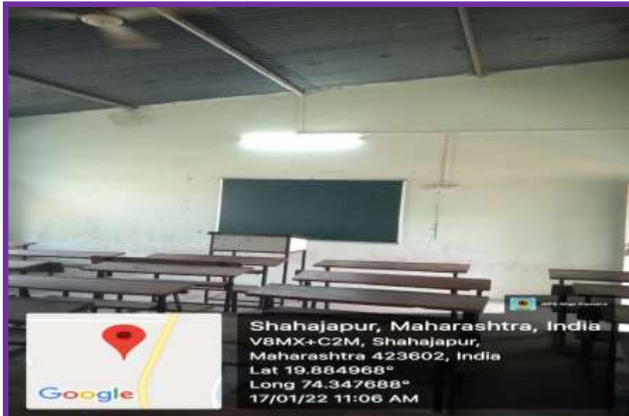
Lecture Hall No. 4