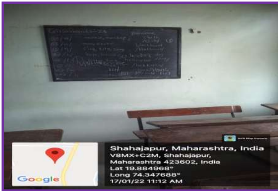
Lecture Hall No. 7