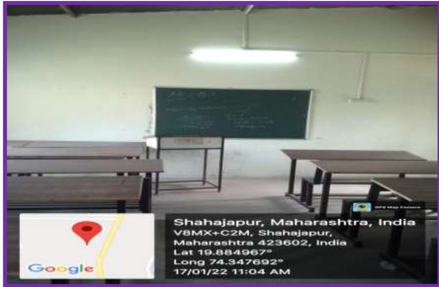
Lecture Hall No. 3