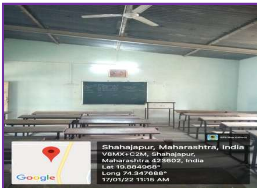
Lecture Hall No. 8