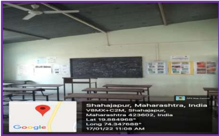
Lecture Hall No. 5