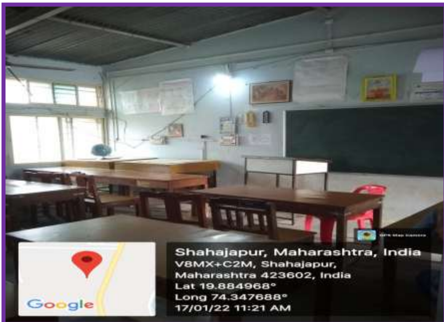
Lecture Hall No. 9

Shahajapur, Maharashtra, India V8MX+C2M, Shahajapur, Maharashtra 423602, India Lat 19.884968° Long 74.347688° 17/01/22 11:21 AM