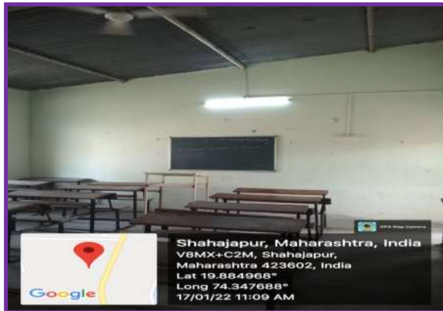
Lecture Hall No. 6